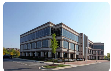
9707 KEY WEST AVENUE