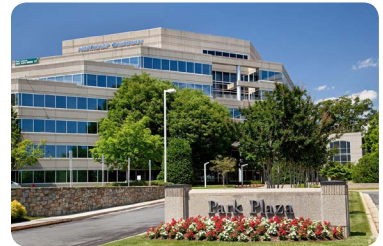
2101 GAITHER ROAD