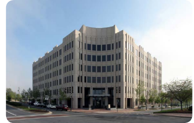
805 KING FARM BOULEVARD