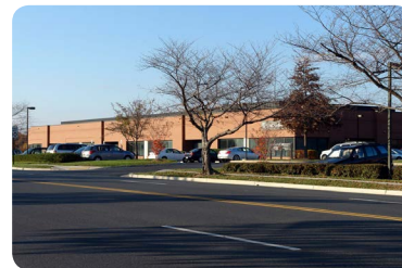
217 PERRY PARKWAY

• ATCC – Leased 31,000 square feet at 217 Perry Parkway to grow their Maryland operations.