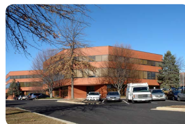
4 RESEARCH COURT

• REGENXBIO – Expanded by 19,500 square feet in the neighboring building to ramp up their research operations.