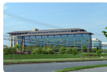
9704 MEDICAL CENTER DRIVE

• BioQual – Expanded their operations in the Rickman portfolio by taking 15,500 square feet at 4 Research Court.