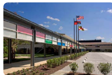
9712 MEDICAL CENTER DRIVE

• ATCC – Leased 31,000 square feet at 217 Perry Parkway to grow their Maryland operations.